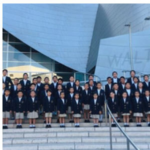
VOCIELESTI CHILDREN'S CHOIR