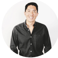
TED CHEN GENERAL ASSIGNMENT REPORTER FOR NBC4