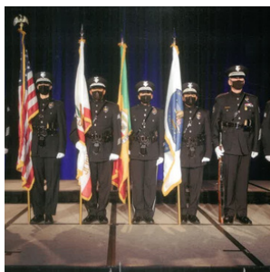
LAPD HONOR GAURD