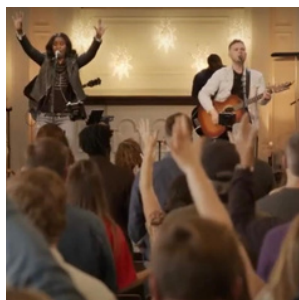
MULTIETHNIC CHOIR WITH MEMBERS FROM FAITH CENTRAL & VINTAGE CHURCH