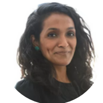
NITHYA RAMAN LOS ANGELES CITY COUNCILMEMBER