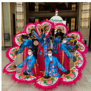
PAVA WORLD KOREAN TRADITIONAL DANCE TEAM