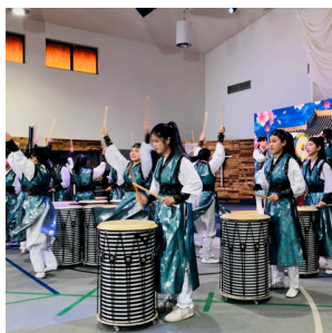
HIZA YOO KOREAN DANCE INSTITUTE