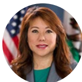
State Treasurer Fiona Ma, CPA CA State