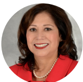
Supervisor Hilda L. Solis LA County